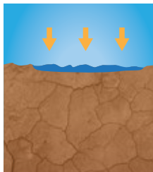
Non Treated Soil

STORAGE AND DISPOSAL: Store in the closed, original container in a dry, cool, well-ventilated area out of direct sunlight. Triple-rinse containers before disposal. Dispose of rinsate or any undiluted chemical according to state/territory legislative requirements. If recycling, replace cap and return clean containers to recycler or designated collection point. If not recycling, break, crush or puncture and deliver empty packaging to an approved waste management facility. If an approved waste management facility is not available, bury the empty packaging 500mm below the surface in a disposal pit